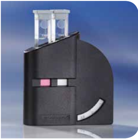
Front view of the CHECKIT® Comparator with cells