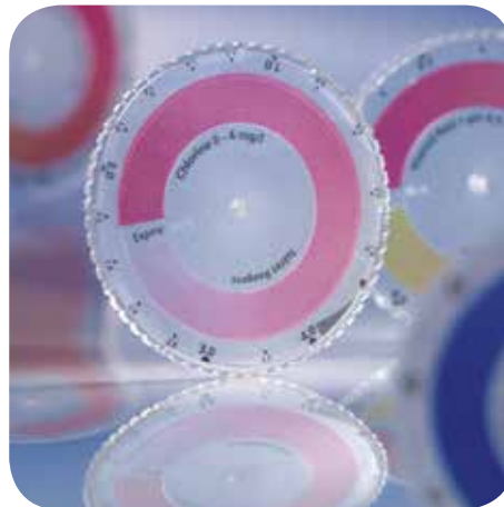
CHECKIT® Discs with continuous colour scales