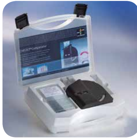
Test Kit complete in case