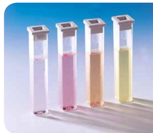
Plastic cells, volume 10 ml

Material Safety Data Sheets: www.lovibond.com