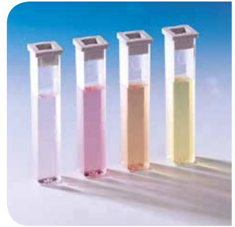
Plastic cells, frosted on two sides, volume 10 ml, path length 13.5 mm, with lid