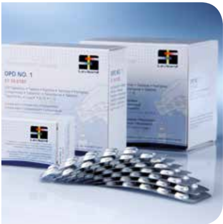
Tablet reagents in blister