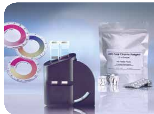
CHECKIT® Comparator with powder reagent/ tablets

Material Safety Data Sheets: www.lovibond.com