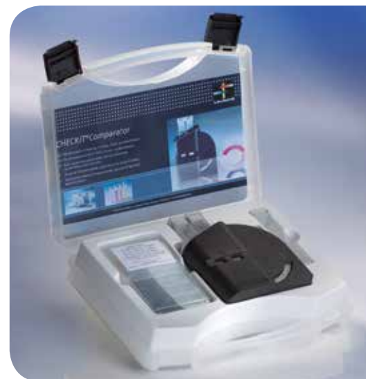
Test Kit complete in case

Material Safety Data Sheets: www.lovibond.com