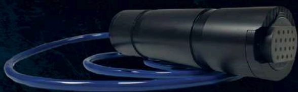
AQ5 5m rated

Profilers, Buoys, Vehicles, Moorings, River Stations, Sondes, Ferry boxes, Flow-through Systems & Flow Lines.